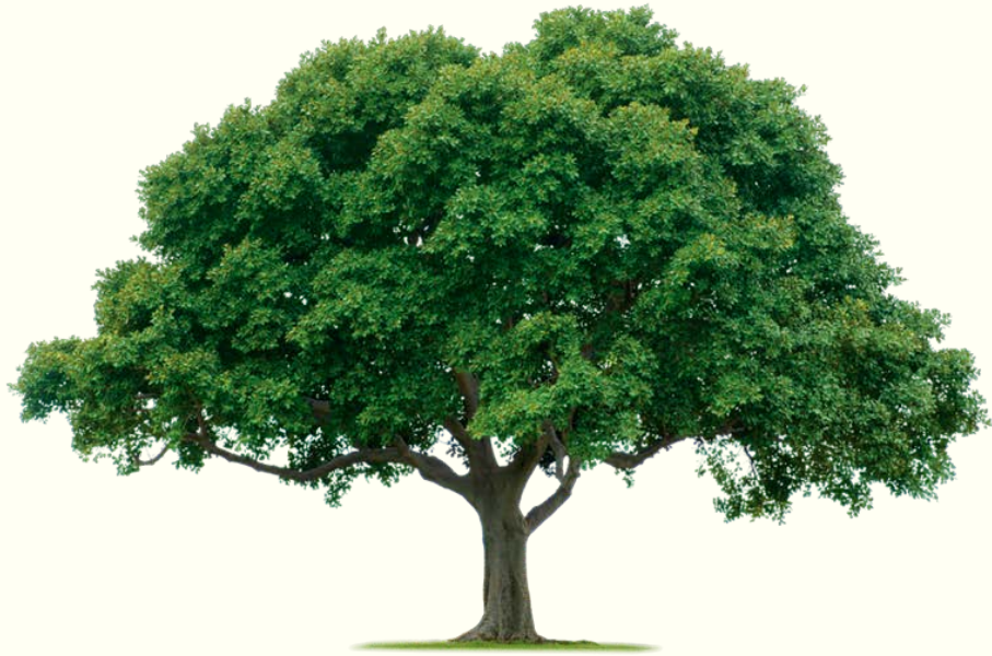
Tree of the Knowledge of Good and Evil